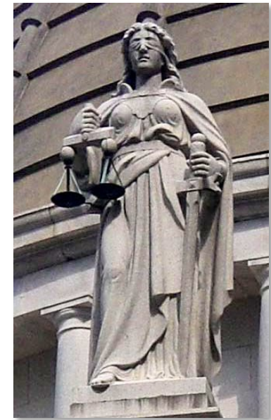
Justitia at Court of Final Appeal, Hong Kong (Reprinted with permission under CC-BY-SA-3.0)

Since the 15th century, Lady Justice has often been depicted wearing a blindfold. The blindfold represents objectivity, in that justice is or should be meted out objectively, without fear or favour, regardless of money, wealth, fame, power, or identity; blind justice and impartiality.